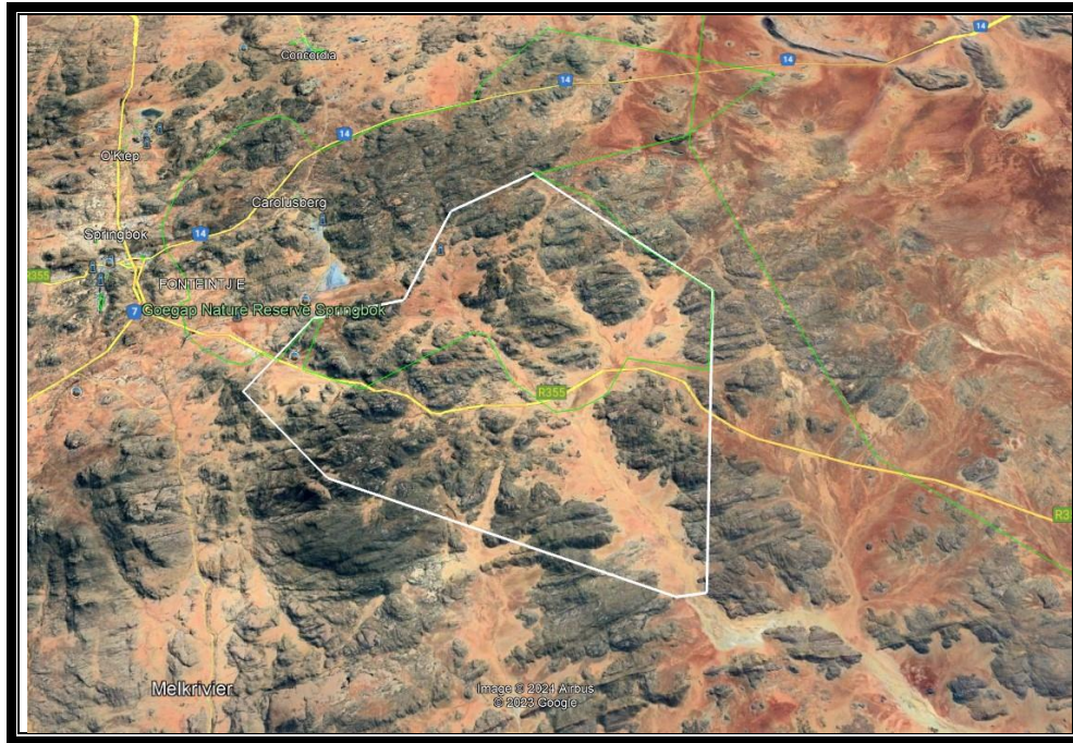
Figure 1: Satellite view of the proposed prospecting right area of Solium Energy (Pty) Ltd.

The following list represent the alien invasive species that would normally occur in the area which is listed as invasive species within the NEM:BA A&IS Regulations, namely: